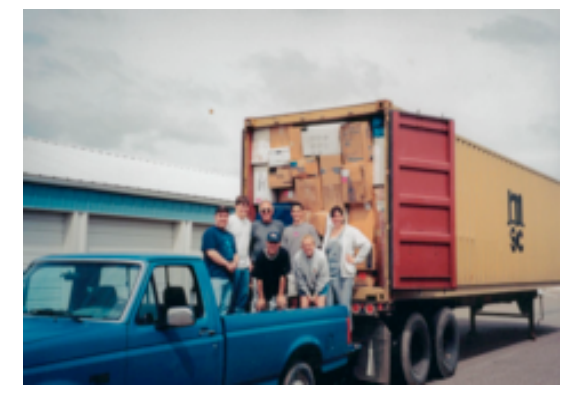
Visit us at: WWW.HealingDrUMM.org

contact us at: soulbrosampson@yahoo.com 301 588-2925